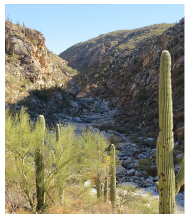
Tanque Verde Falls Trail Tucson, Arizona Jon Marenfeld

Because it comes from a climate like ours planting and care is simple. Plant Eucalyptus papuana in late spring or early summer in full sun and reflected heat locations with typical well-drained desert soils. Once established it is a moderate grower that is relatively drought tolerant but will do best with supplemental irrigation during the hottest and driest times of the year. Elevate the canopy as needed when young and there is no need to thin it out. Pair it with various Eremophila 's, Senna 's, Callistemon viminalis , and Lomandra longifolia for a bit of Australia in your yard.