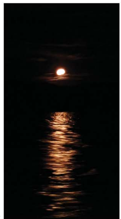
Full Moon Rising Lake Mohave, NV Matt Durham